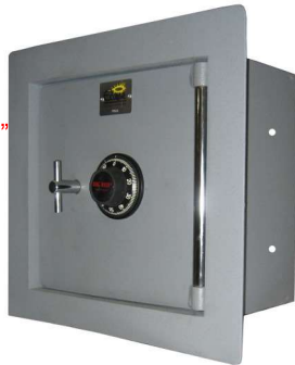
Wall Safe 2-NR