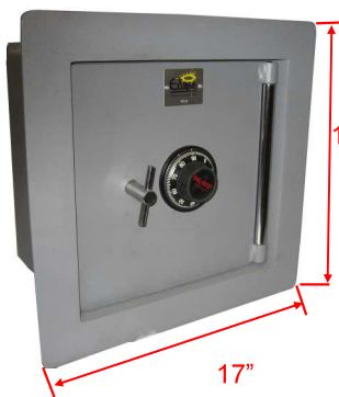
Wall Safe 1-NR