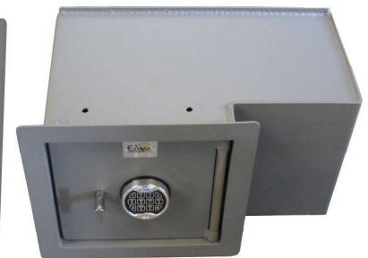
Wall Safe 4-NR (Shown with Electronic Lock)