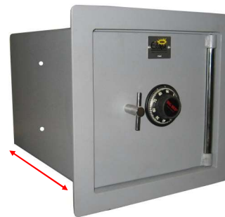
Depth Wall Safe 3-NR